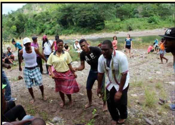
Scotts Hall Maroon engaged hikers in one of their cultural dances

This Maroon culture and nature hike was convened in the Maroon community of Scotts Hall, St Mary on Saturday, 6th of December.