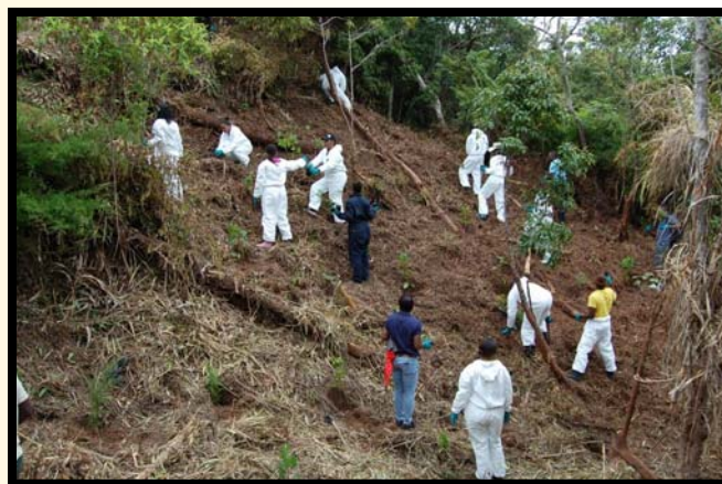
Staff from Energy Partners engaged in a tree planting exercise at Holywell Recreational Area.

This year there has been no reforestation, only maintenance of existing 27 hectares (67.5 acres) of reforested lands at Cinchona (funded by the Forest Conservation Fund) and at Sherwood (funded by Recreation Pathways). Unfortunately a major fire at Cinchona in July at the height of the drought burned about 33 acres of reforested lands (the Forestry Department lost significantly more). There was invasive species control at Mt. Horeb – across from Holywell, with 1 ha of wild ginger cleared. At Holywell, Jamaica Energy Partners had a work-day on National Tree Planting Day - 3 rd October when they planted native tree seedlings on 0.8 ha of land cleared of invasive species. On the same day, the Sandals Foundation/ATL launched their Drive Green Campaign and committed to sponsor at least 1 acre of forest rehabilitation at Holywell.