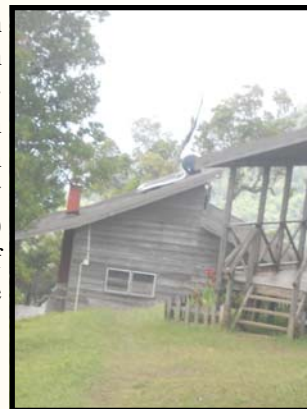
Cabins equipped with solar panels

By early March, 2015 an interpretive and educational programme will be installed at Holywell under the theme of climate change and renewable energy. This will also see a re-vamping of the Visitors’ Centre. In March, the National Park will host a three day workshop to help us prepare updated plans for our Environmental Management System and Disaster Risk Management and Emergency Preparedness.