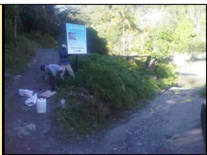
Community Signage on Climate Change and Flooding—Location: Brook Lodge