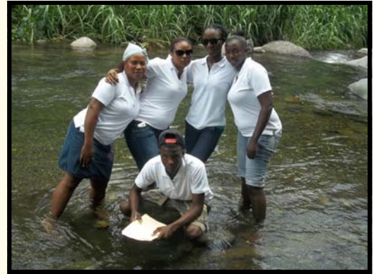
River Wardens posing for the camera

Again JCDT takes this opportunity to thank the Environmental Foundation of Jamaica for funding assistance given in the protection and conservation of the Blue and John Crow Mountains National Park. Lessons learnt from this project were noted and will be incorporated in future projects of a similar nature.